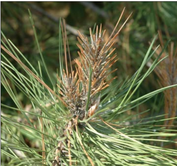
Figure 1. Newly emerging (current-year) shoots are susceptible to tip blight. The shoots are stunted, and the needles are stunted and brown.

In late summer or fall, tiny black spore-producing structures (called pycnidia) are formed on the scales of