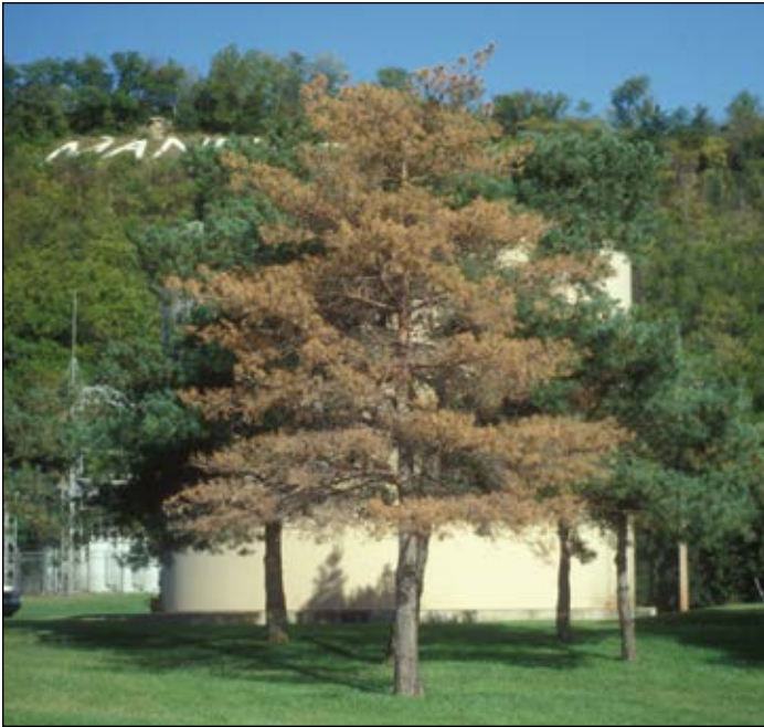
Figure 7. Pine wilt can kill an entire tree in weeks or months.

particular, increasing numbers of Austrian pines have been affected in recent years.