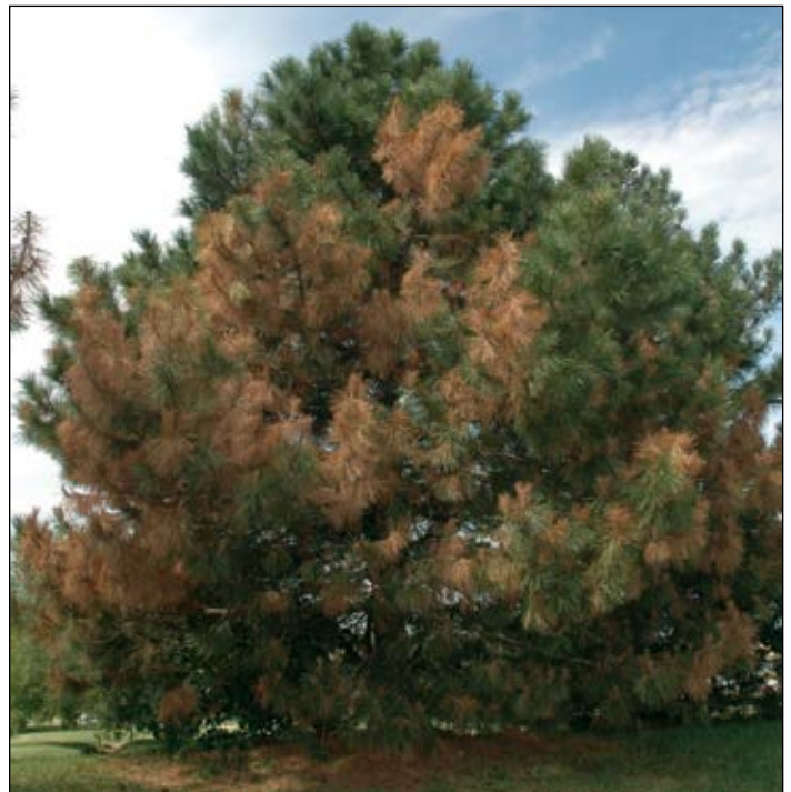
Figure 2. Severely infected trees can have tip blight throughout the crown. On some branches, the disease has progressed from the tips inward to older wood.