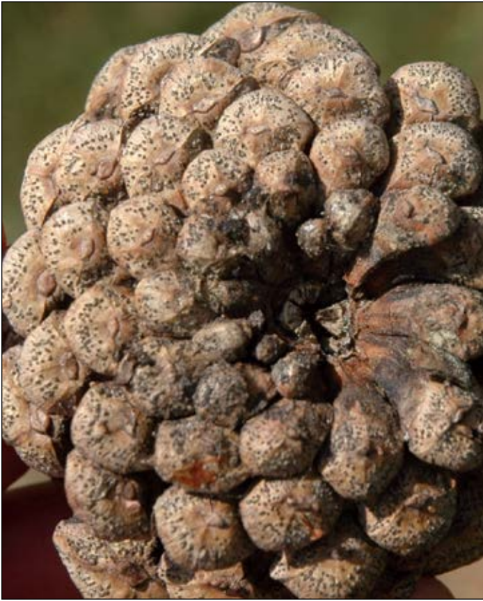
Figure 3. Black spore-producing structures of the tip blight fungus are visible on 2-year-old pine cone scales.

2-year-old cones — it looks like black pepper has been shaken onto the cones (Figure 3). The same black specks are also sometimes visible at the base of the infected needles later in the summer.