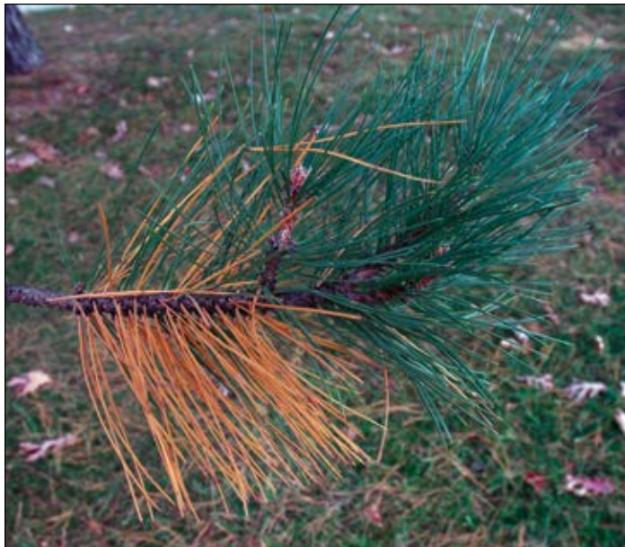
Figure 8. During natural needle drop, inner needles turn brown and are shed. Note that the needles are brown from tip to base. They do not have the partial-scorch of Dothistroma needle blight.

With natural needle drop the older, inner needles throughout the tree turn brown and shed in the fall (Figure 8). The shedding takes 2 to 3 months to complete. The appearance of the tree eventually improves as it produces new growth. Browning and dropping of the current-season growth is not natural needle drop.