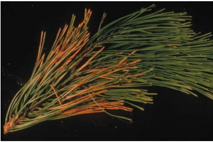
Figure 5. Dothistroma needle blight causes a partial-needle scorch (browning) on interior needles (1-, 2-, or 3-year-old needles).

drop (see below). However, a key indicator for Dothistroma is that the tip of the needle (beyond the red band) turns brown, but the base stays green for several months resulting in a partial needle scorch (Figures 4 and 5). The disease is usually most severe in the lower part of the tree on the interior parts (1-, 2-, or 3-year-old needles). The current needles sometimes show symptoms as well.